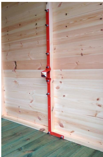
Secure Anchor Point