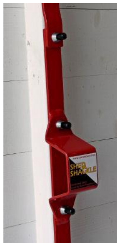
Simple to install