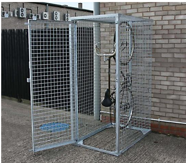
Vertical Cycle Cage