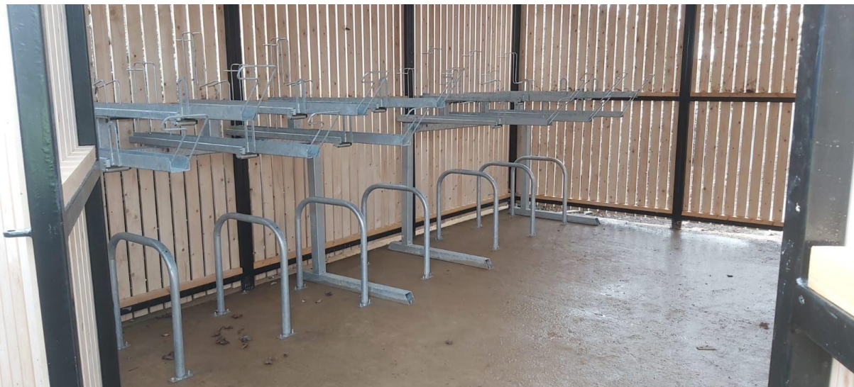
Economy Two Tier with Sheffield Stands beneath

We recommend that two tier racks are used with a minimum ceiling height of 2526mm. This ensures that bikes stored on the upper level can be stored away safely and easily.