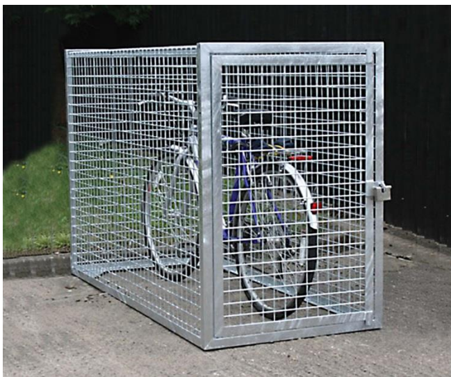
Horizontal Cycle Cage

We offer a full range of galvanised cycle cages for single bikes for either horizontal or vertical storage. Our mesh cycle lockers are an extremely robust and secure cycle locker. The combination of mesh and fully welded angle iron ensures the mesh cycle locker offers a high level of cycle parking security. The door is internally hinged to further increase the security and the provision for the user to use their own padlock further enhances the security of the mesh cycle locker. The mesh cycle locker is also available with an optional galvanised sheet steel roof panel to provide the bicycle with protection from the weather and a cycle holder to provide support for the bicycle.