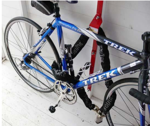
Can be used with up to two bikes